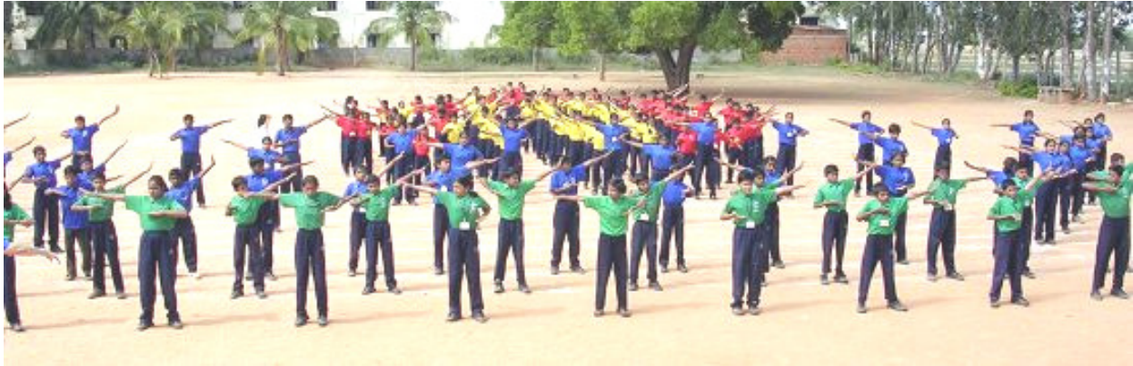
Students in SRI K.V. English School learn to practice the first set of Falun Gong exercises.

SRI K.V. English School is over one hundred kilometers away from Bangalore. There are eight hundred students enrolled at the beautifully landscaped school situated in a scenic area of India.